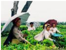
Asia commemorates IMD