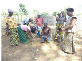
Celebrating IMD in Africa