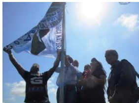
IMD in the Americas