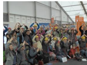
European events for IMD